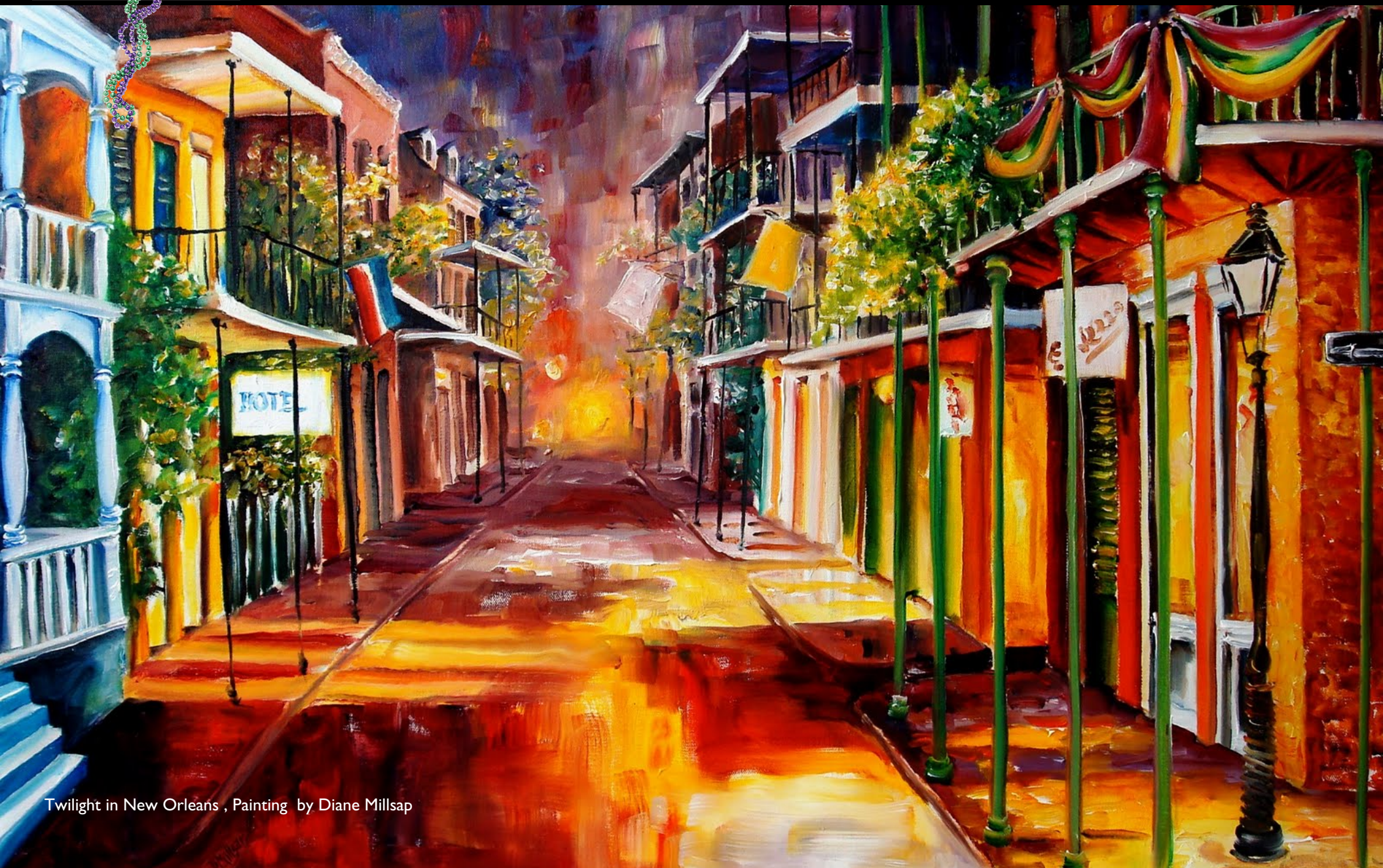
Twilight in New Orleans , Painting by Diane Millsap

NEW ORLEANS, LOUISIANA SEPTEMBER 22-25, 2013